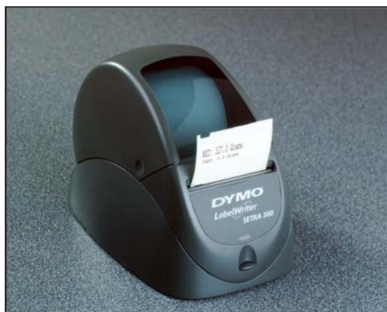
Dymo™ Labelwriter SE300 Thermal Printer